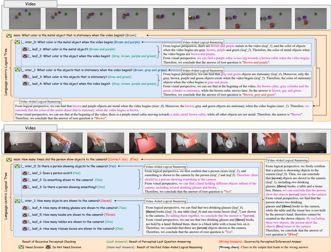
Figure 3. Qualitative examples on MVBench (Li et al., 2024b) generated by VideoChat2 (Li et al., 2024b) with our LTR framework.